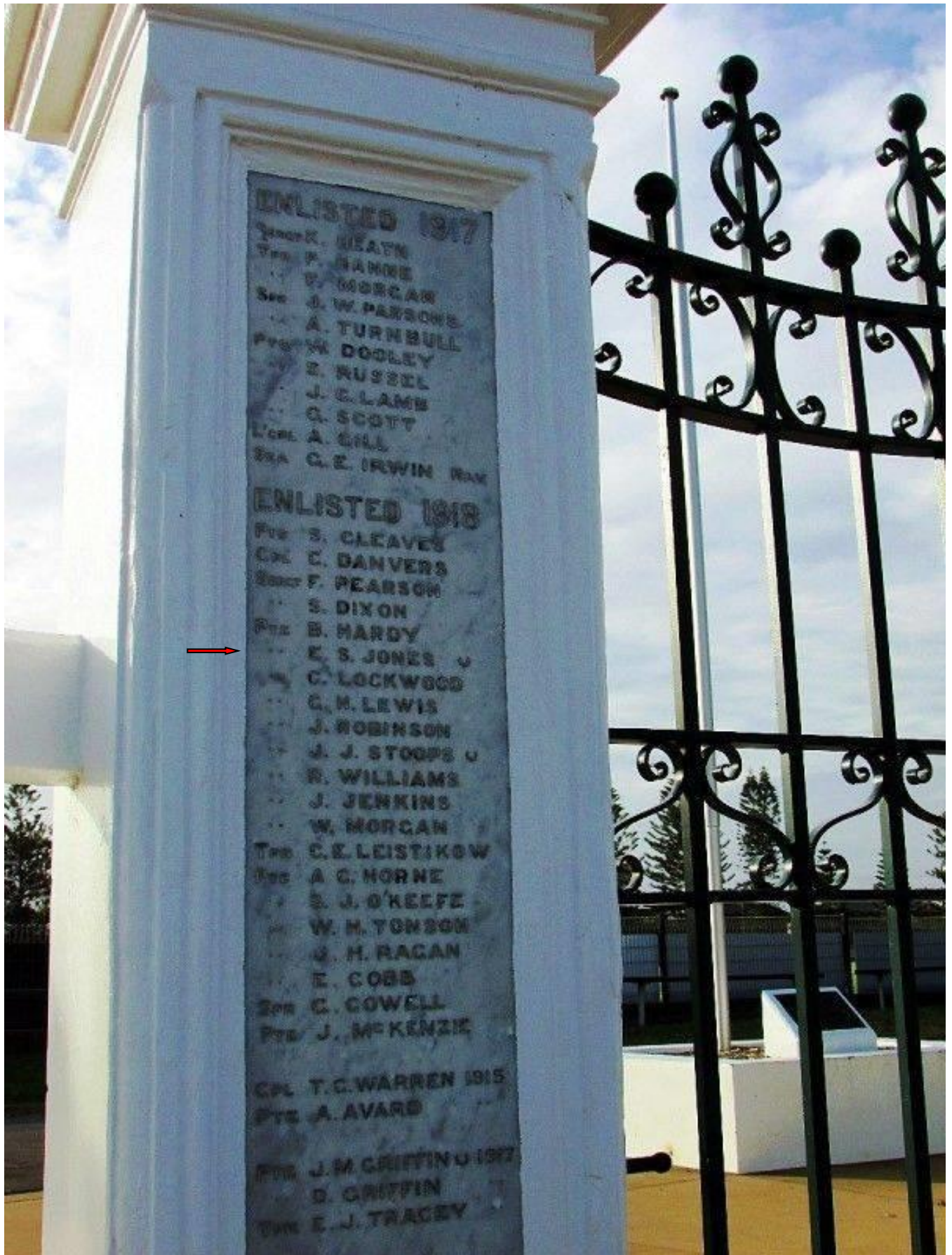
Mitchell Park, Memorial Gates at Merewether, NSW